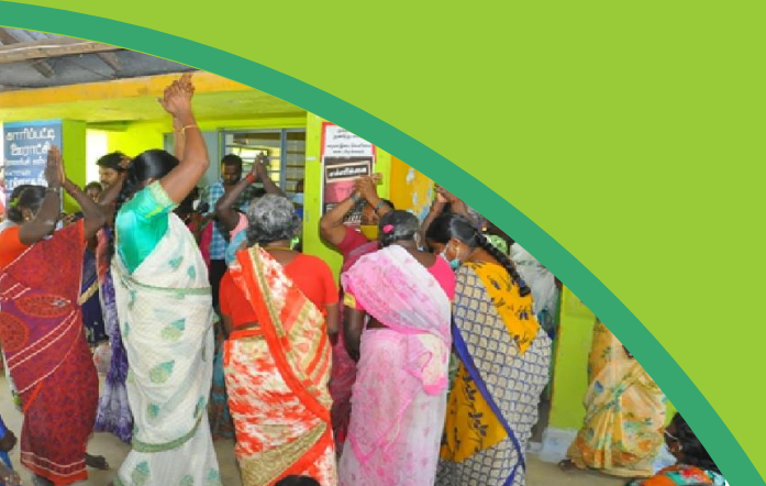
the Worksite Facilitator spoke about