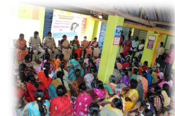
Women come together to celebrate the International Women's Day on the theme