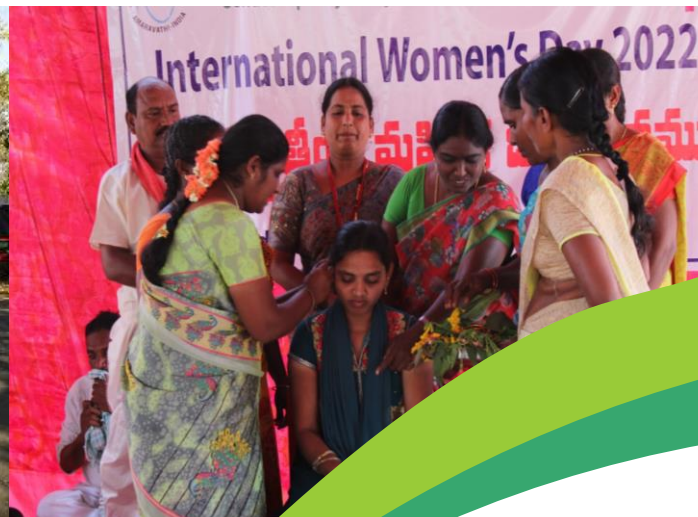
For VENNILA, Nalangu ceremony Nalangu is con