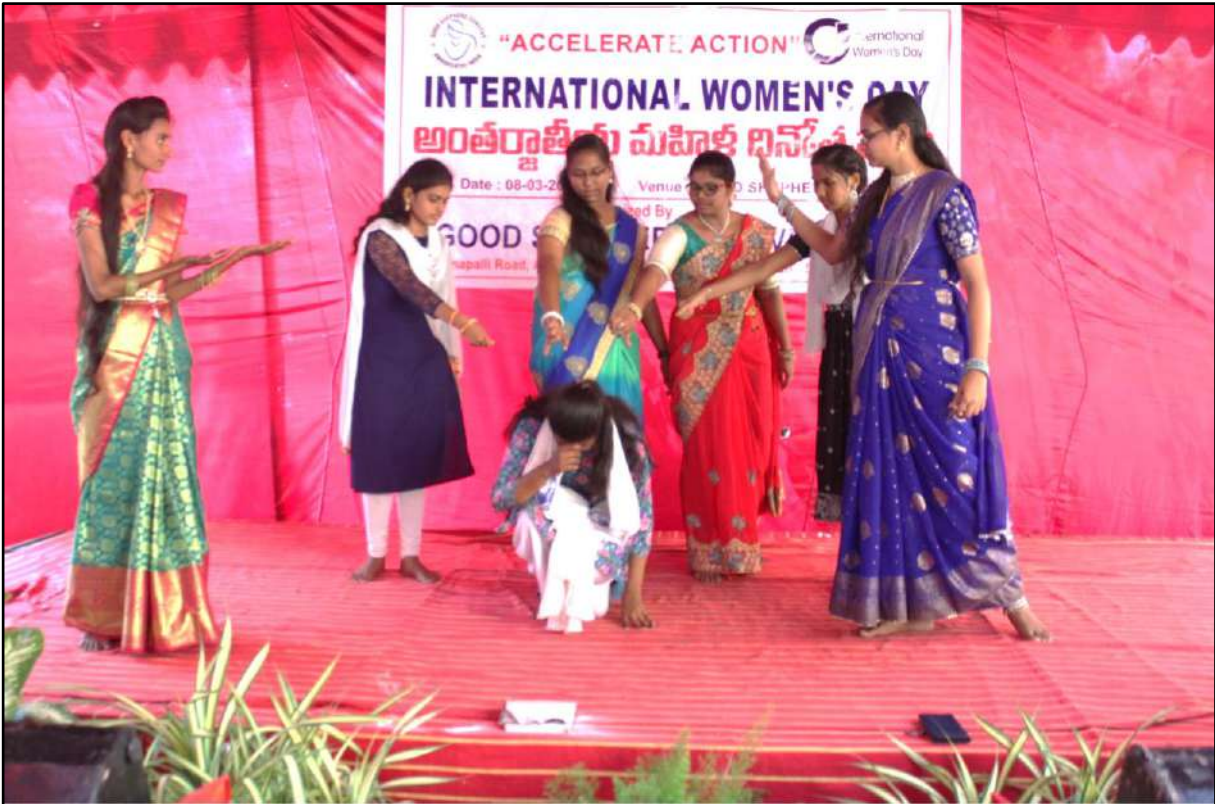
"Women Today," a play by adolescent girls of the Good Shepherd Computer Literacy and Spoken English Course, powerfully portrays women's silent struggles from birth to death in a male-dominated society.