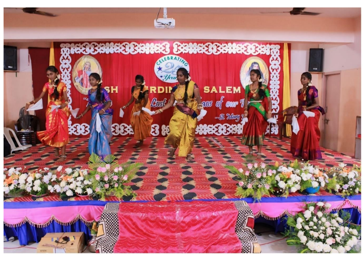
Young Women from ICDS (Inclusive Community Development Services) of Good Shepherd Convent, Nochipatty (Salem) dance for a thanksgiving to the Universe for its Unconditional love.