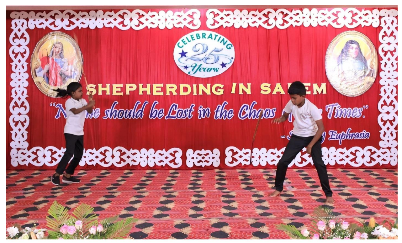
Children from ICDS (Inclusive Community Development Service) initiatives perform Silambam (a Tamil Traditional Self-Defence Art form) as a Tribute to the Services rendered by Sisters of the Good Shepherd.