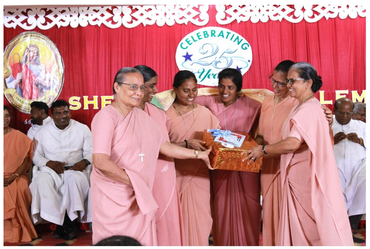
Sisters of the neighbouring religious communities offer gifts in appreciation of 25 years of commitment towards the people in need of care and support.