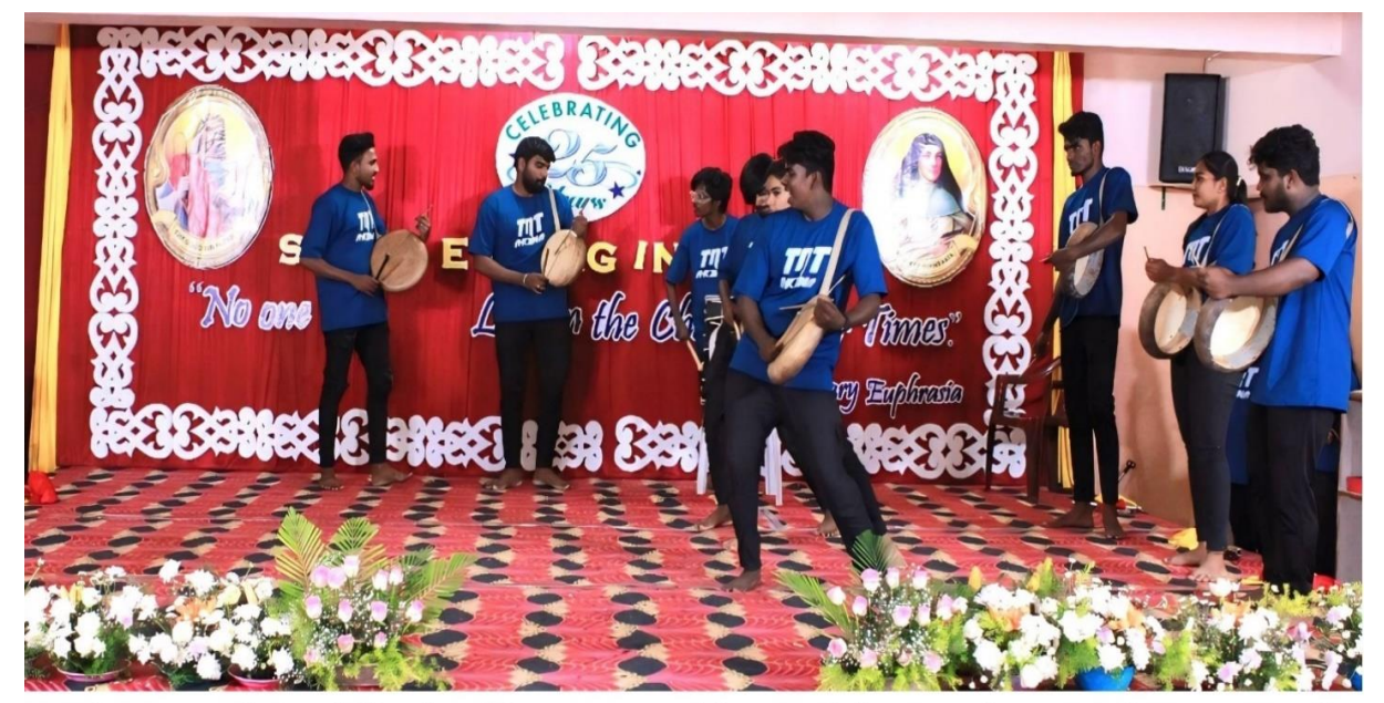
Volunteers of Good Shepherd Convent, Nochipatty (Salem) perform Parai Attam (Tamil Folk Dance) and express their gratitude to the Sisters and their Partners-in-Mission.