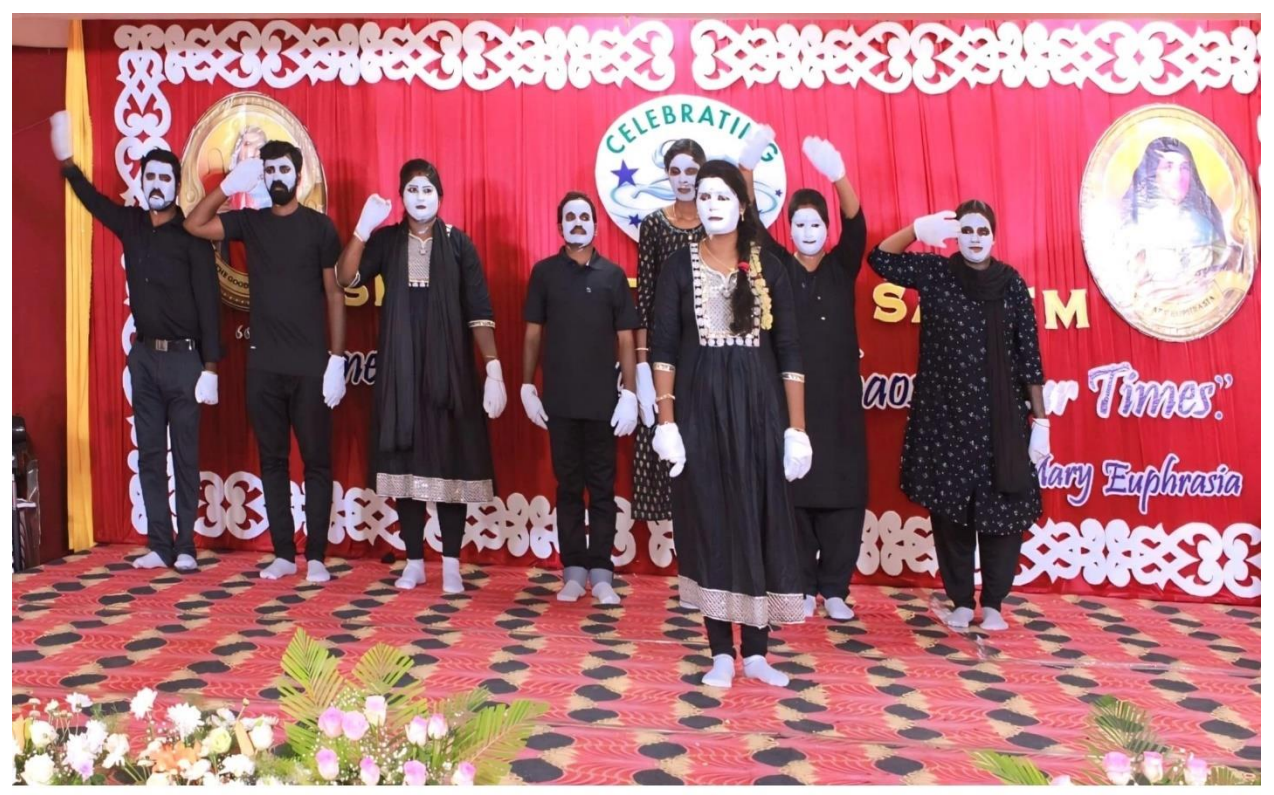
A Mime by the Partners-in-Mission of Good Shepherd Convent, Nochipatty (Salem) enact the life-long discrimination being inflicted on girl children and the means of restoring rights, honour and pride to girl children.