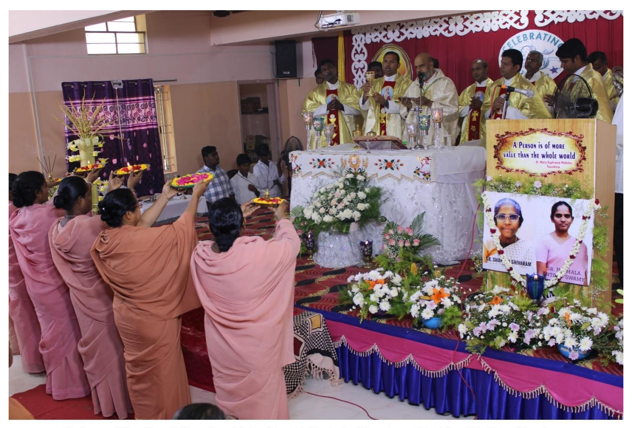
Sisters of the Good Shepherd take floral tribute to Shepherd God for His Sacrifice to Redeem the Humanity - A Gesture of Gratitude by the Sisters of the Good Shepherd.